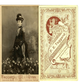
4" x 6.5" taken in Lynn in 1889