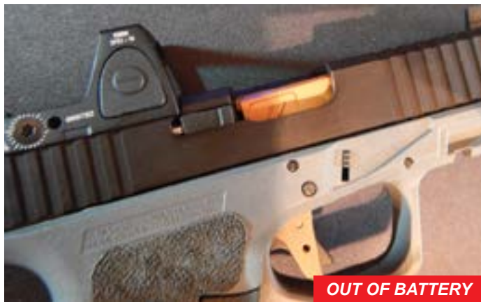
OUT OF BATTERY