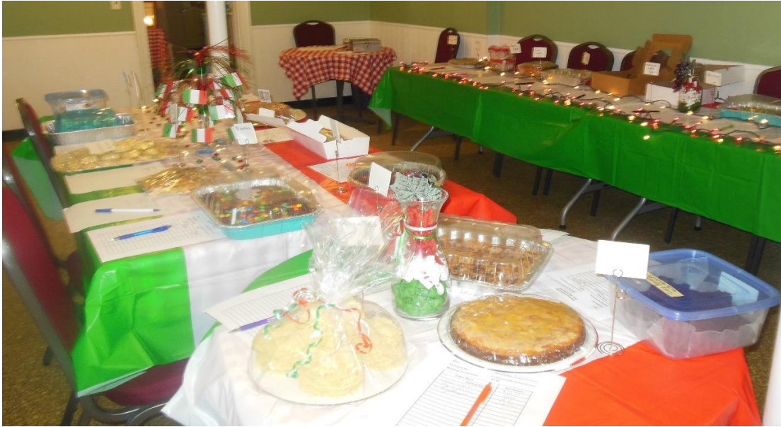
Goodies for our charity Bake Sale