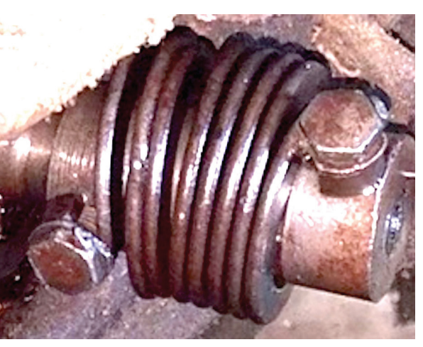
Bent and twisted Bendix spring