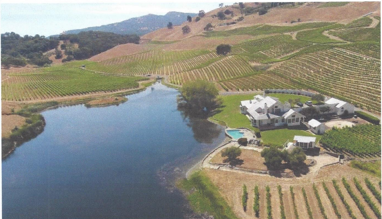
Vineyard estate in Napa Valley with private lake, $9.5m