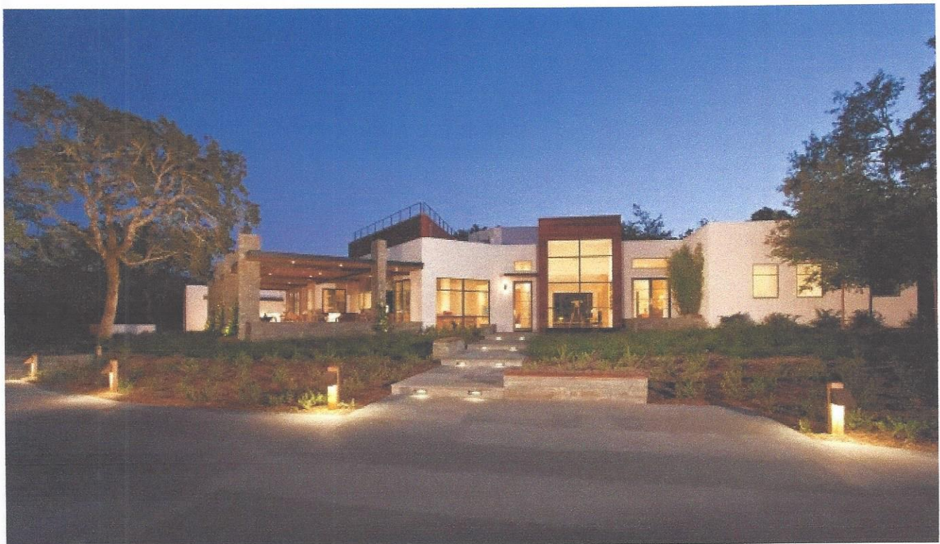
Home with 24 acres of land in Calistoga, $8.75m

In neighbouring Sonoma, the same agent is selling a 13-acre estate, with a five-bedroom, five-bathroom house and 20,000 Pinot Noir and Chardonnay vines, for $2.3m.