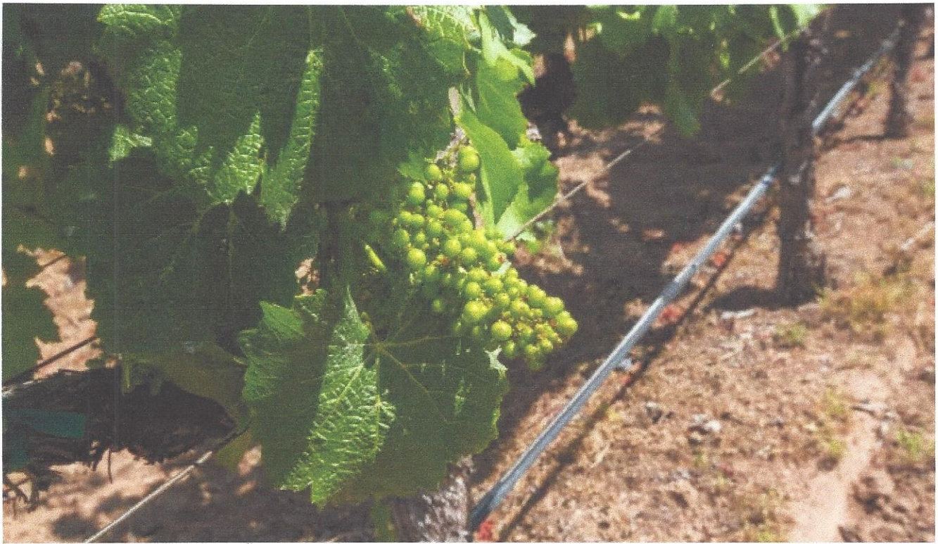
One of the grapevines at Firefly Vineyards

On the other side of Howell Mountain from the centre of Napa Valley, the sun beats down and a small lake glistens. Far from the tourist-jammed roads, the silence is broken only by birdsong. Since Calla Lily Vineyards was bought by CCF Wines, a group of Hong Kong-based businessmen in 2013, the tasting room has been closed to visitors.