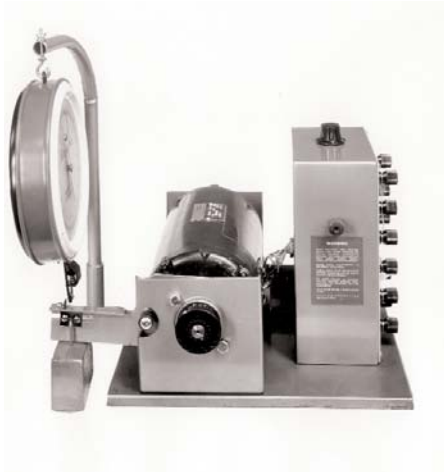
MODEL DYN-100A-DM Dimensions: 10" H x 13" W x 14" D Shipping Weight: 70 lbs

The Hampden Model DYN-100A-DM is a DC motor/generator cradled in sealed bearings to form a trunnion mount. It may be used: (1) as a DC machine in the determination of DC series, shunt, and compound motor and generator characteristics, (2) as a prime mover in generator and alternator load tests, and (3) as a generator to measure motor torque in either direction of rotation.