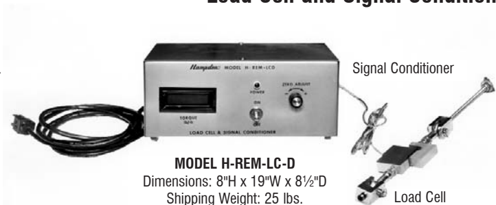
MODEL H-REM-LC-D Dimensions: 8"H x 19"W x 8½"D Shipping Weight: 25 lbs.

The Hampden Model H-REM-LC-D Load Cell is designed to be used with any standard Hampden dynamometer, replacing the circular scale. The signal conditioner measures and displays torque on a digital read-out. Two separate amplifiers are used to permit torque measurements in either English units (lb-ft) or SI units (N-m). Separate analog output (0-5V DC) is available via Hampden HR-1S receptacles on the rear of the unit.