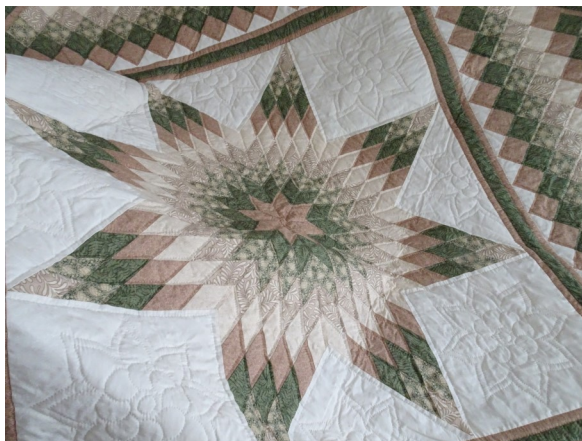
Detail of Star Queen-Size Quilt seen at right.