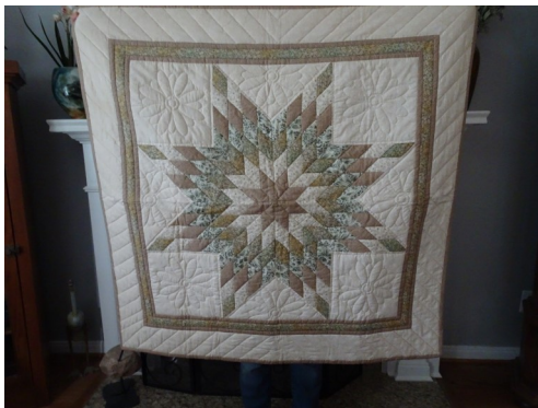
Beige Oatmeal Star Wall Hanging 3-1/2' x 3-1/2'