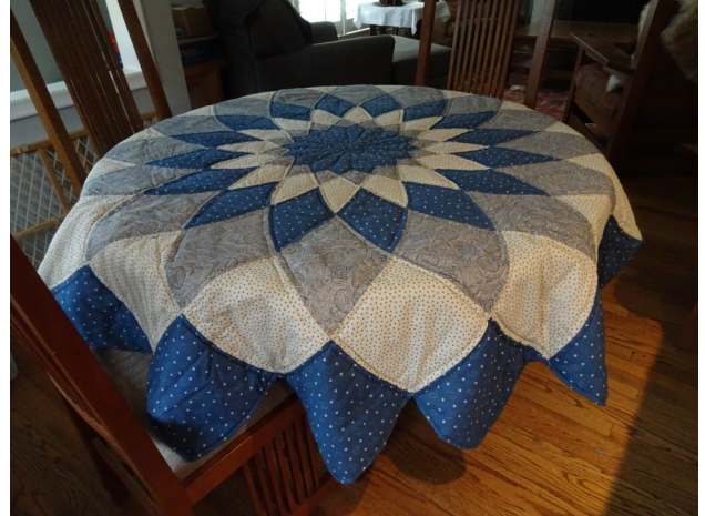
Round Blue/Beige Tablecloth