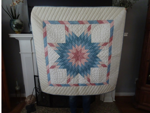
Blue Star Wall Hanging 3' x 3-1/2"

We will begin selling raffle tickets for each of these quilts at the June meeting. The quilts, donated by Bette Lepouttre, are going to be raffled off to members only. Cost is $5 per ticket or 3 for $10. You can choose the quilt you want to put your money on!