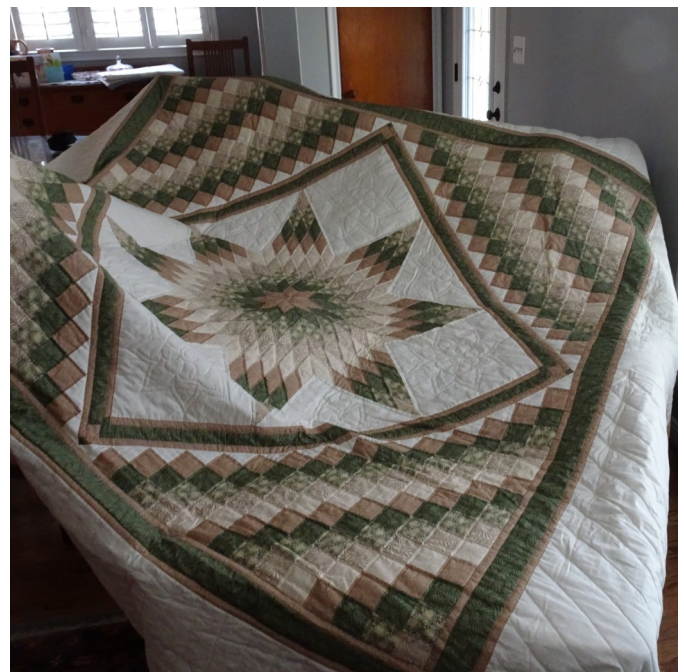
Queen-Size Quilt (detail of star at left)