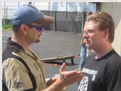
No, no, do it like this...