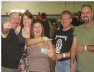
Frog people pointing