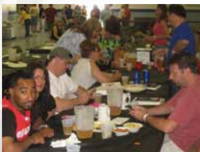
Springfield shows up!