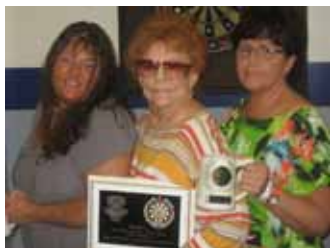
2010 Topaz First Place