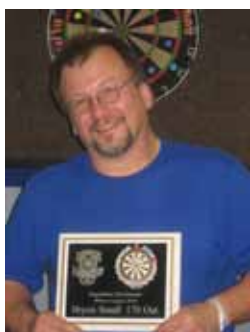
The trophy says it all!