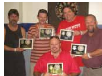
2010 Gold Div. Second Place