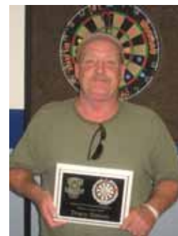
xxx 2010 Grenn Singles First