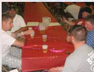
We need more tickets!