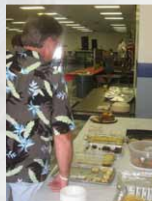
Who ate all the cookies!?