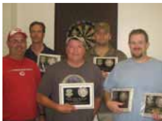
2010 Blue Div. First Place