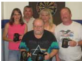
Mugs for Winners!