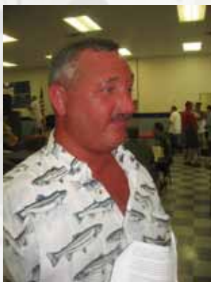
Can you say sunburn?