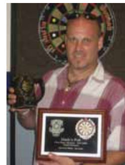
"CW" 2010 Pearl First Place