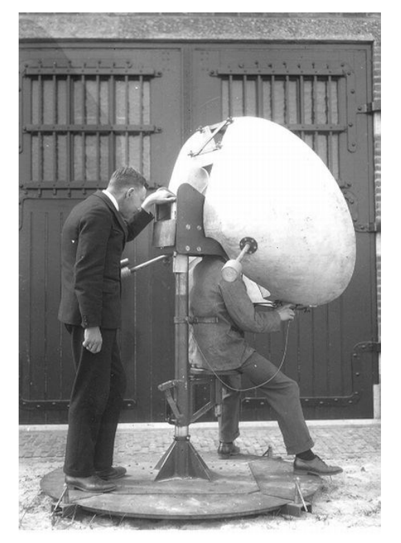
"Acoustic Ears" - on a swivel