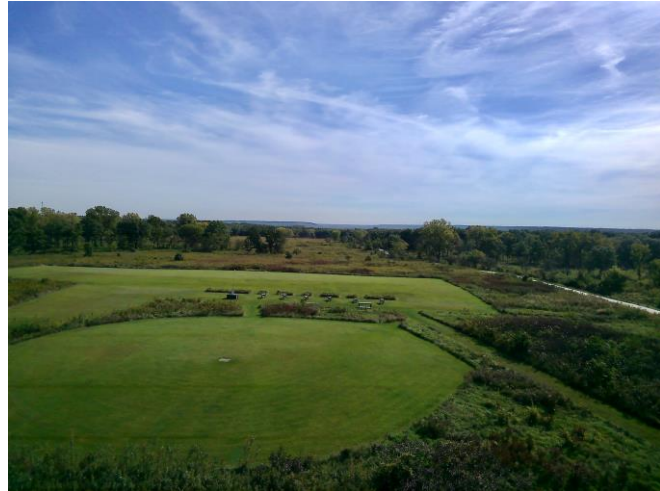
Woodland Aero Modeler's Flying Field at Waterfall Glen Forest Preserve, Lemont, Illinois