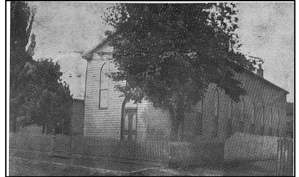
The original church before it was moved down the street to make way for the church that we know today. That original church is now known as St. Mary's Hall.