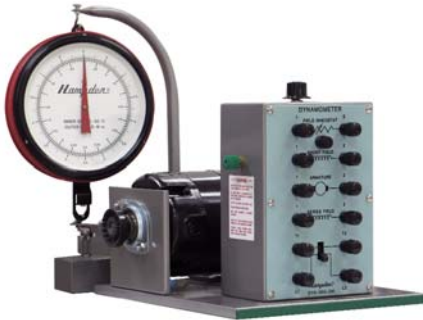
MODEL DYN-100A-DM Dimensions: 10" H x 13" W x 14" D Shipping Weight: 70 lbs

The Hampden Model DYN-100A-DM is a DC motor/generator cradled in sealed bearings to form a trunnion mount. It may be used: (1) as a DC machine in the determination of DC series, shunt, and compound motor and generator characteristics, (2) as a prime mover in generator and alternator load tests, and (3) as a generator to measure motor torque in either direction of rotation.