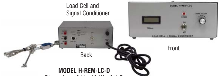
MODEL H-REM-LC-D Dimensions: 8"H x 19"W x 8½"D Shipping Weight: 25 lbs.

The Hampden Model H-REM-LC-D Load Cell is designed to be used with any standard Hampden dynamometer, replacing the circular scale. The signal conditioner measures and displays torque on a digital read-out. Two separate amplifiers are used to permit torque measurements in either English units (lb-ft) or SI units (N-m). Separate analog output (0-5V DC) is available via Hampden HR-1S receptacles on the rear of the unit.