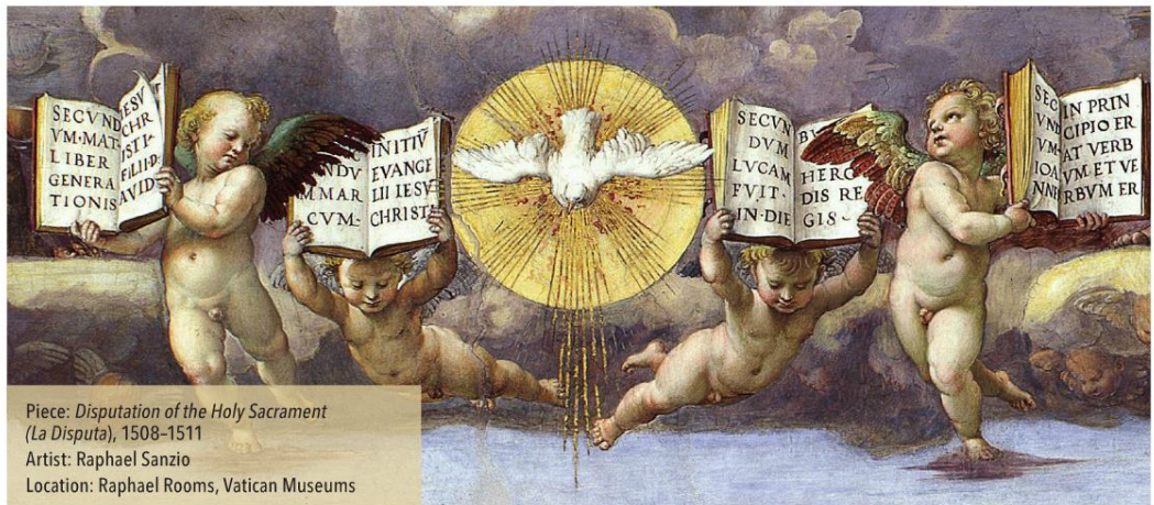
Piece: Disputation of the Holy Sacrament ( La Disputa ), 1508-1511 Artist: Raphael Sanzio Location: Raphael Rooms, Vatican Museums

What helps increase my awareness of the Holy Spirit's presence in me? Which one of the seven gifts of the Holy Spirit do I most need?