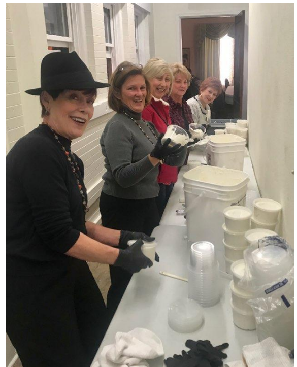
ABOVE: Members of the Friendship Round Table spent time at their meeting to prepare icing for the Gingerbread Houses that were sold at the Christmas Faire.