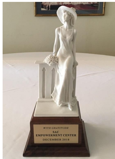
"Eleanor" was a gift to us at last year's event.

The Empowerment Center at SAC has changed the lives of many students, and we are proud to be a part of it!