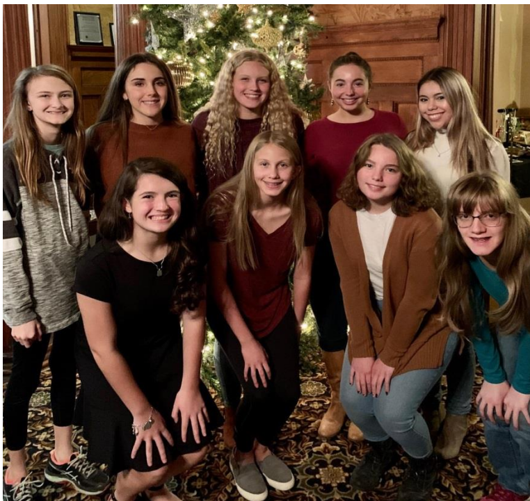
TOP: Members of the Ingenue RT met to prepare for their annual party for Respite Care at the Mansion this month.. ABOVE: The members enjoyed a photo op in front of the Christmas Faire tree "in design progress."