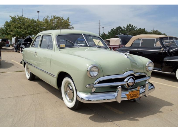
My first car-not this exact one but the same year, color and model