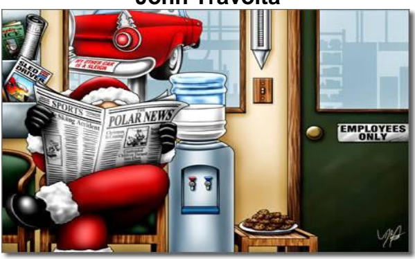
We can't forget Santa's