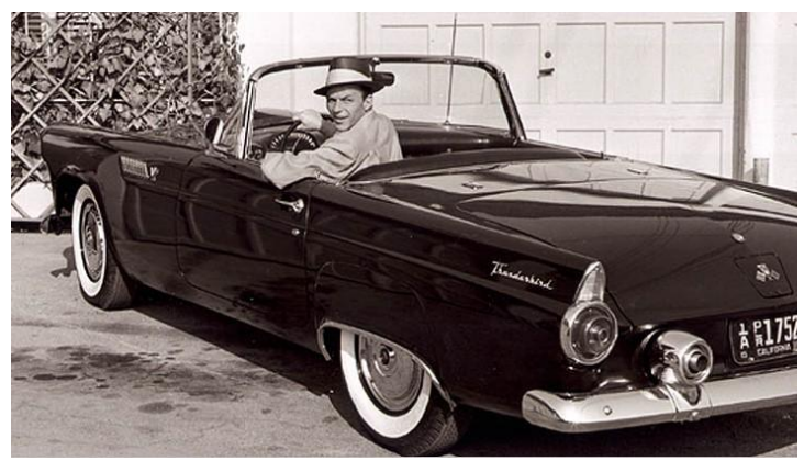
The "Boss" Frank Sinatra