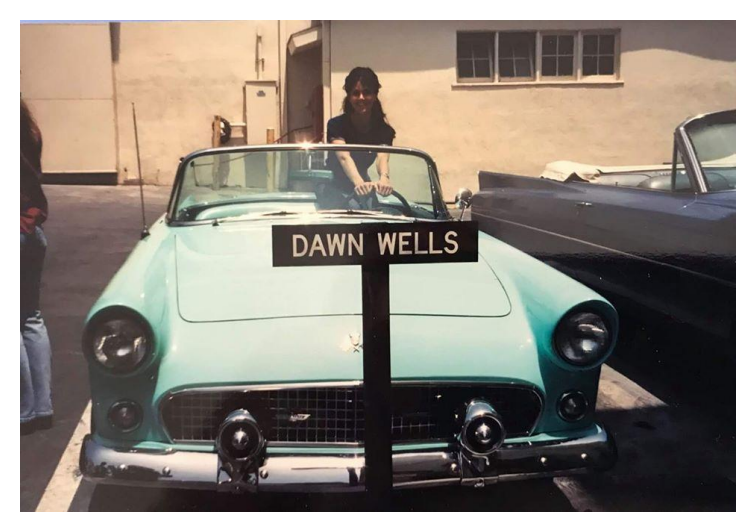
(Maryanne - Gilligan's Island)

Do we leave cars worth thousands in the driveway and put our useless junk in the garage