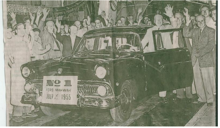
First car off assembly line - Mahwah 7/15/55

Why is it that at class reunions you feel younger than everybody looks?