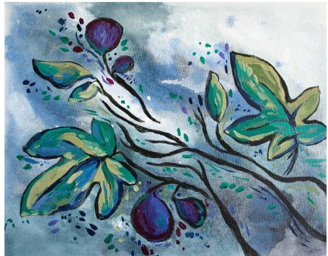
"WHERE THE FRUIT LIES"

But where the landowner sees waste, the gardener perceives possibility that lies fallow. The gardener has learned from the land that life flows in cycles—budding, flourishing, pruning, death. And so he requests one more year. Cutting the earth with a shovel, he loosens the clots that have settled like stone so that when water comes, the earth will receive it like a soft kiss. He blankets the roots with manure so that growth can be steadied by hope. And then he lets go.