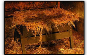
The Cradle and the Cross

Of the increase of his government and peace there will be no end (Isaiah 9:2, 6-7, NIV).