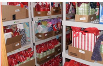
Shelves of Christmas Gifts for Delivery

As we observe the “traditions” of Christmas, my prayer is that “every knee should bow” before the Son, the Light of the world, “the baby wrapped in cloths and lying in a manger” (Luke 2:12, NIV).