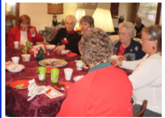
Volunteers' Christmas Luncheon