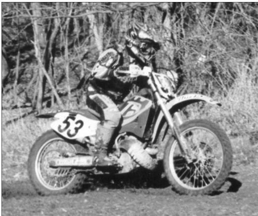
Spud takes a break from promoting the Hill Billy GP series to have some fun at Toys for Tots

I must mention the start of the second over 40 moto. Bart