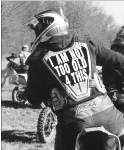
Somebody had to make a statement

woods riders and motocrossers alike. There weren't many rocks and good dirt. The trail just wound back and forth between the trees. The other section was the hill side. It seemed to be the longest section of the course. I think all the rocks from the other two sections had been moved up to this section. They were all square-edge, off-camber, loose and plated, and of course they were covered