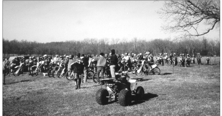
Here's some hard core racers waiting for the start

I didn't get exact numbers, but I think about 60 bikes and 30 ATVs showed up. That's a real big number, con-