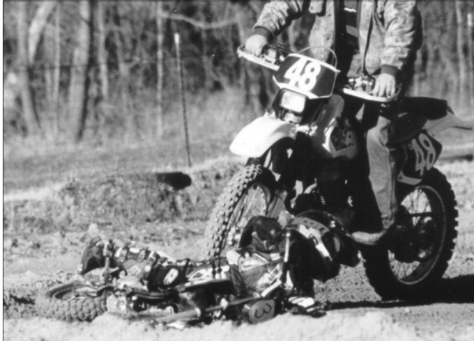
Here's a crash and burn shot from the kids' race. You can see Dad's ready to help.