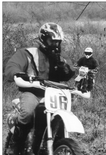
Somebody is still warm enough to give the thumbs up.

After the race, I was standing so close to a fire trying to keep warm, I almost set my coveralls on fire!