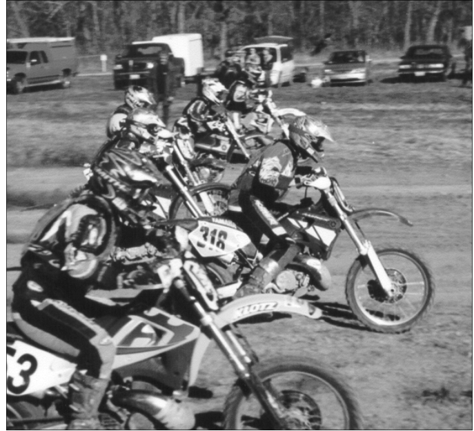
The start of the expert class, first moto.

with a thin layer of mud. Did I mention the logs? Well, let me tell you about the logs. There really weren't all that many, but every single one was slick and angled the wrong way. This year there were enough entrants that beginners and eight-