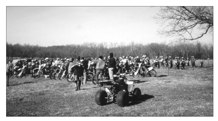
Here's some hard core racers waiting for the start

I didn't get exact numbers, but I think about 60 bikes and 30 ATVs showed up. That's a real big number, con-