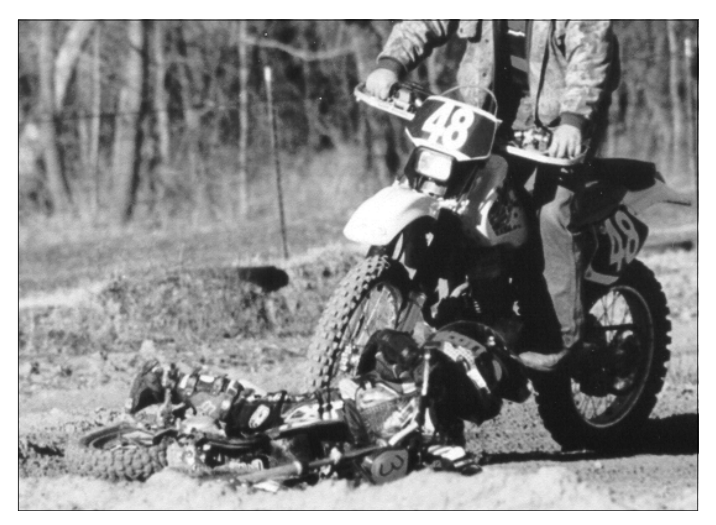
Here's a crash and burn shot from the kids' race. You can see Dad's ready to help.