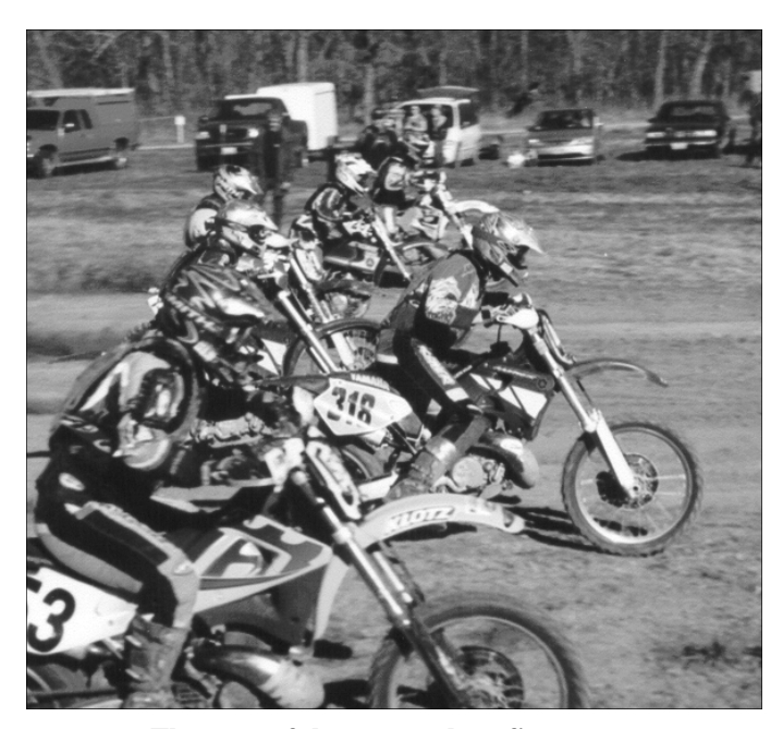
The start of the expert class, first moto.

with a thin layer of mud. Did I mention the logs? Well, let me tell you about the logs. There really weren't all that many, but every single one was slick and angled the wrong way. This year there were enough entrants that beginners and eight-