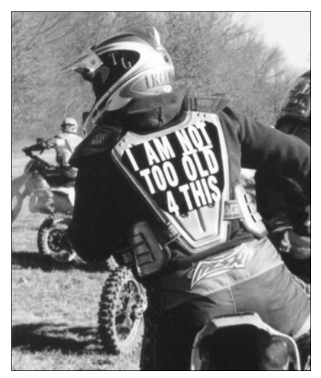
Somebody had to make a statement

woods riders and motocrossers alike. There weren't many rocks and good dirt. The trail just wound back and forth between the trees. The other section was the hill side. It seemed to be the longest section of the course. I think all the rocks from the other two sections had been moved up to this section. They were all square-edge, offcamber, loose and plated, and of course they were covered