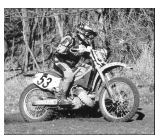
Spud takes a break from promoting the Hill Billy GP series to have some fun at Toys for Tots

I must mention the start of the second over 40 moto. Bart