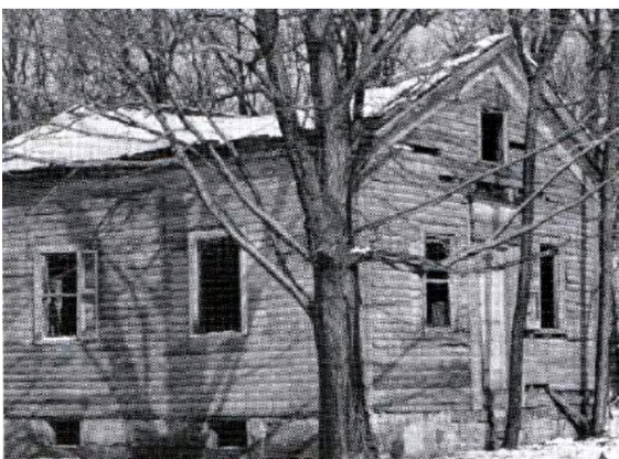
District School House 7

The schoolhouse below right was from district 3 on Bedford road (Rt. 14). It still stands at 11526 Ravenna Road, it had a second floor added and is currently a private residence. Schoolhouse 3 was originally located down the street at 10908 Ravenna and moved to its current location.