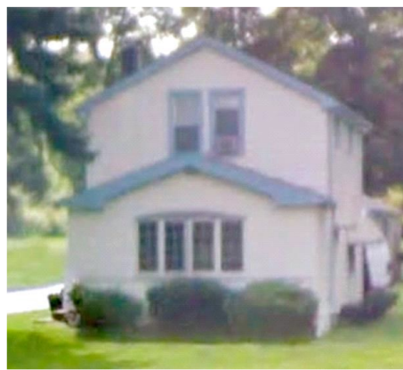
District School House 3