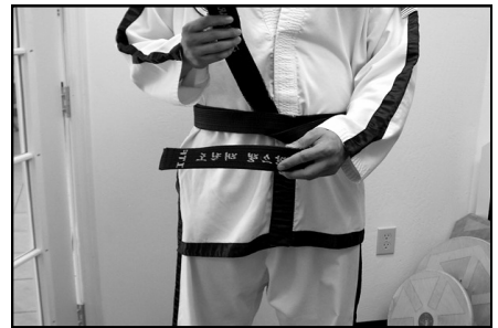
Front View Bring the bottom end across.