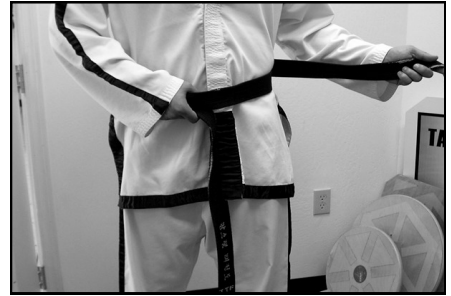
Front View Continue to bring belt ends to the front. One will be inside (underneath), the other on outside (on top).