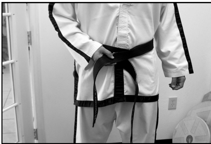
Front View The belt should be completely wrapped around with one end coming around from underneath and the other coming around over the top.