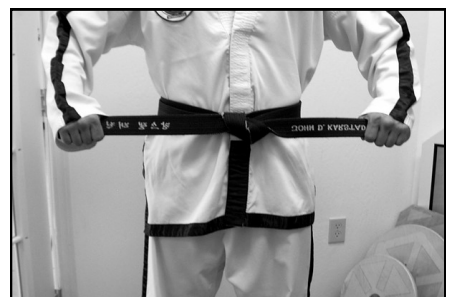
Front View Finish in a square knot.

NEVER wear your belt outside of training. This is a display of arrogance, a disrespect to your art.