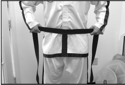
Front View Center the belt in front.