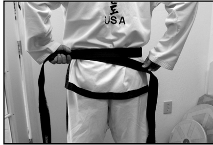
Rear View Bring both ends around. One side should overlap the other so that the belt does not twist and it lays smooth in the back.