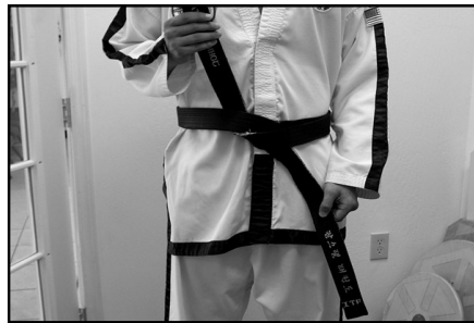
Front View Tuck the outside end behind the belt and out over the top. One end is now down and the other up. At this point check belt ends for equal length.