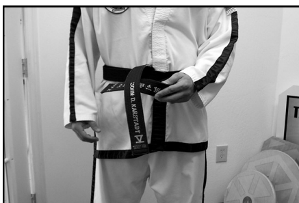
Front View The top end goes over the bottom end and back up through the middle.