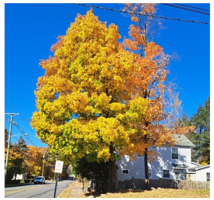
Autumn has come to the trees