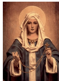
Feast Day: October 7