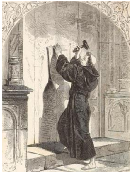
Luther nailing the 95 Theses