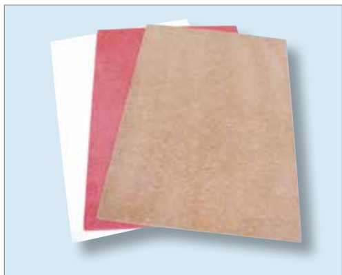
INTERDENS type 15 and type 36.

When exposed to fire, INTERDENS rapidly produces a large quantity of microporous, heat insulating foam, thereby protecting the treated material from fire. It hermetically fits into the gaps formed by distortion and prevents flames, smoke and gases from passing between two construction elements.