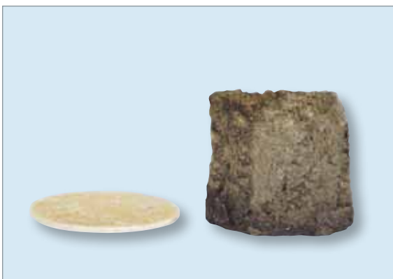
INTERDENS type 36 before and after exposure to fire