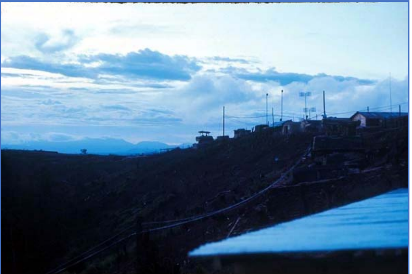
Det 3, Pleiku at dusk.