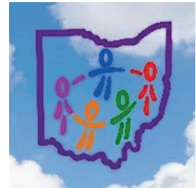
Deaf Community Resource Center plans a new kind of summer camp: Virtual.