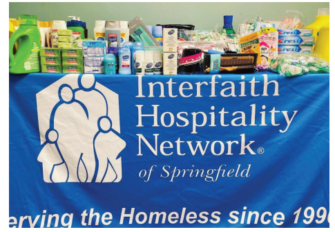
Interfaith Hospitality Network celebrates 30 years of giving.