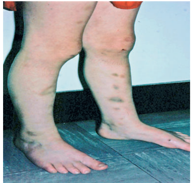
Fig 5. Spontaneous bruising of legs. Written permission received from patient.

dislocation. Excessive bruising in children can often be a presenting symptom to paediatricians, therefore it is imperative that a careful evaluation of the medical and family history and thorough physical examination is performed, paying attention to the skin features that are characteristic of EDS (De Paepe & Malfait, 2004). Facial features in infants with vascular-type EDS may initiate suspicion of the diagnosis, including prominent eyes (due to the lack of subcutaneous adipose tissue around the eyes), small lips, a pinched nose, hollow cheeks and lobeless ears (De Paepe & Malfait, 2004).