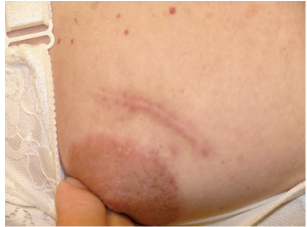
Fig 4. Abnormal scarring after surgery. Written permission received from patient.

Approximately 12% of neonates with vascular EDS are born with clubfoot and 3% have congenital dislocation of the hips (Germain, 2002; Pepin & Byers, 2005). Children may present with pneumothorax, inguinal hernia and recurrent joint