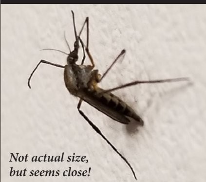
Not actual size, but seems close!