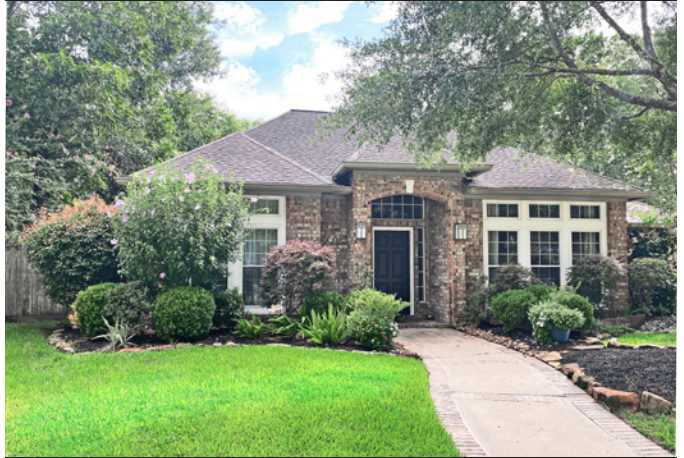
9126 RHAPSODY LANE