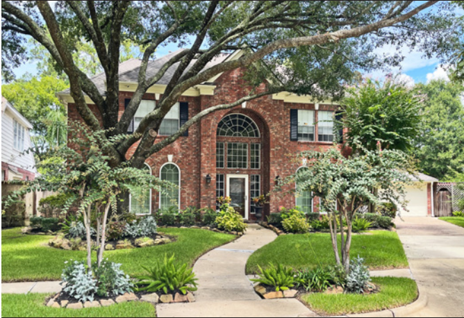
9118 BRAHMS LANE