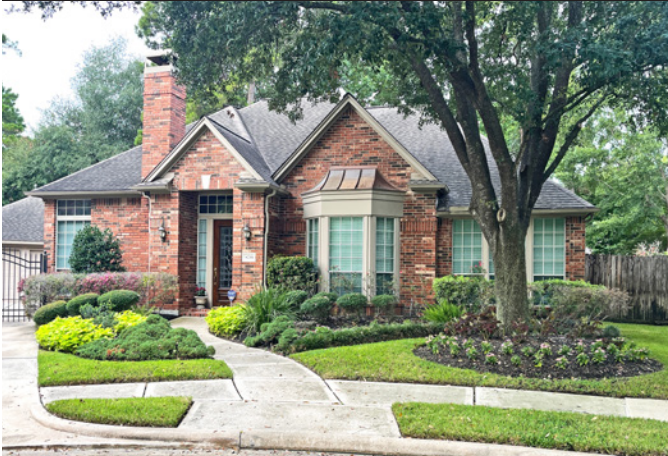
8719 GOLDEN CHORD CIRCLE