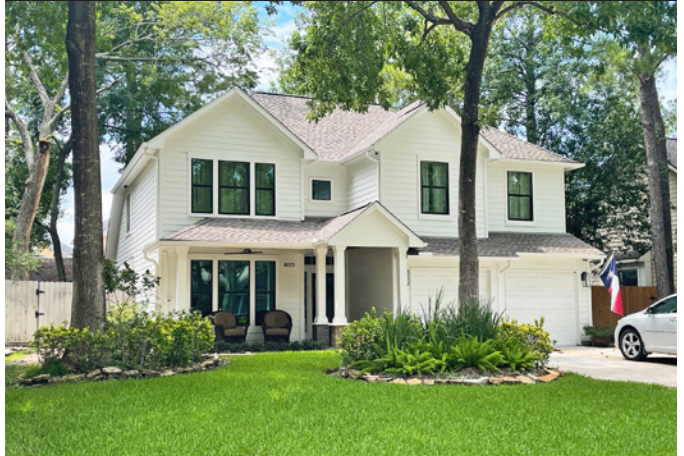
8023 CLARION WAY