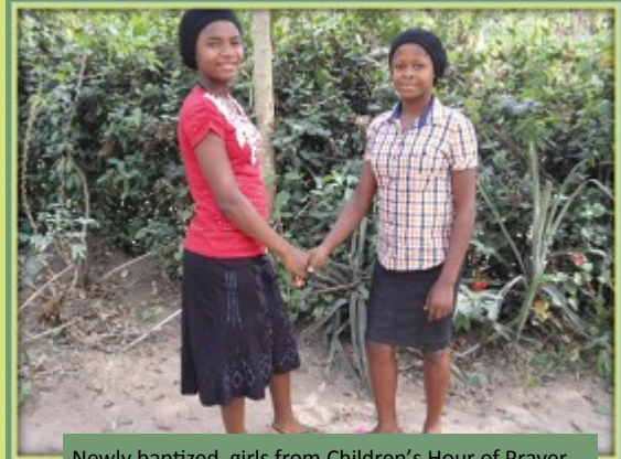
Newly baptized girls from Children's Hour of Prayer.