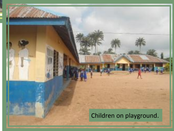
Children on playground.

All the kids in our school are well fed through our daily feeding program. They are in very good physical condition. This is crucial, because most of their families are in abject poverty. During the rainy seasons, the families who live in thatch houses are exposed to cold. Last Quarter, we donated textbooks, calculators and other educational materials to our former students, who now attend high school. We meet with them once every quarter to discuss their welfare and counsel them. They are doing great and we are proud of them.