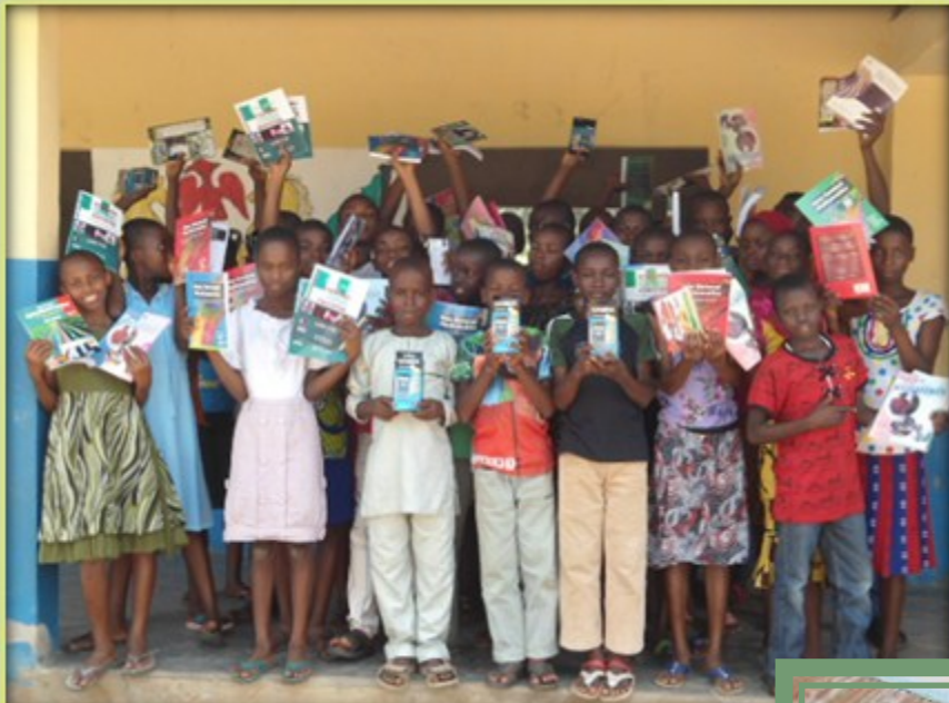
Former students with their donated school supplies.

AFRI is an international organization that partners with Christian Relief Fund and several Churches of Christ throughout the United States. It encompasses: