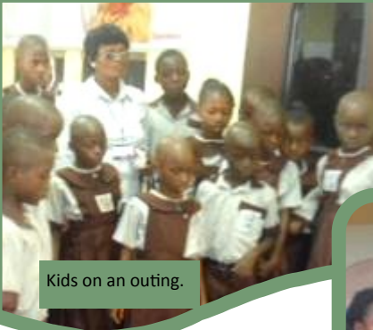
Kids on an outing.