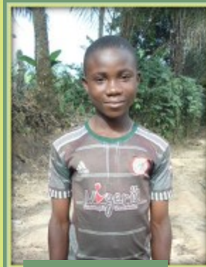
Newly baptized boy.

We have recorded four baptisms within the last quarter. The results from our youth evangelistic work has been very inspiring.