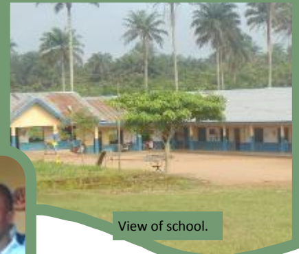
View of school.