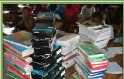
Textbooks, calculators and other education materials donated to former students.