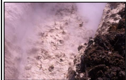
CHP Treated Soils Shown in White Coloration