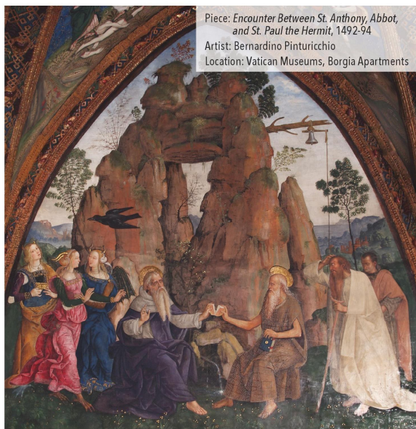
Piece: Encounter Between St. Anthony, Abbot, and St. Paul the Hermit, 1492-94 Artist: Bernardino Pinturicchio Location: Vatican Museums, Borgia Apartments