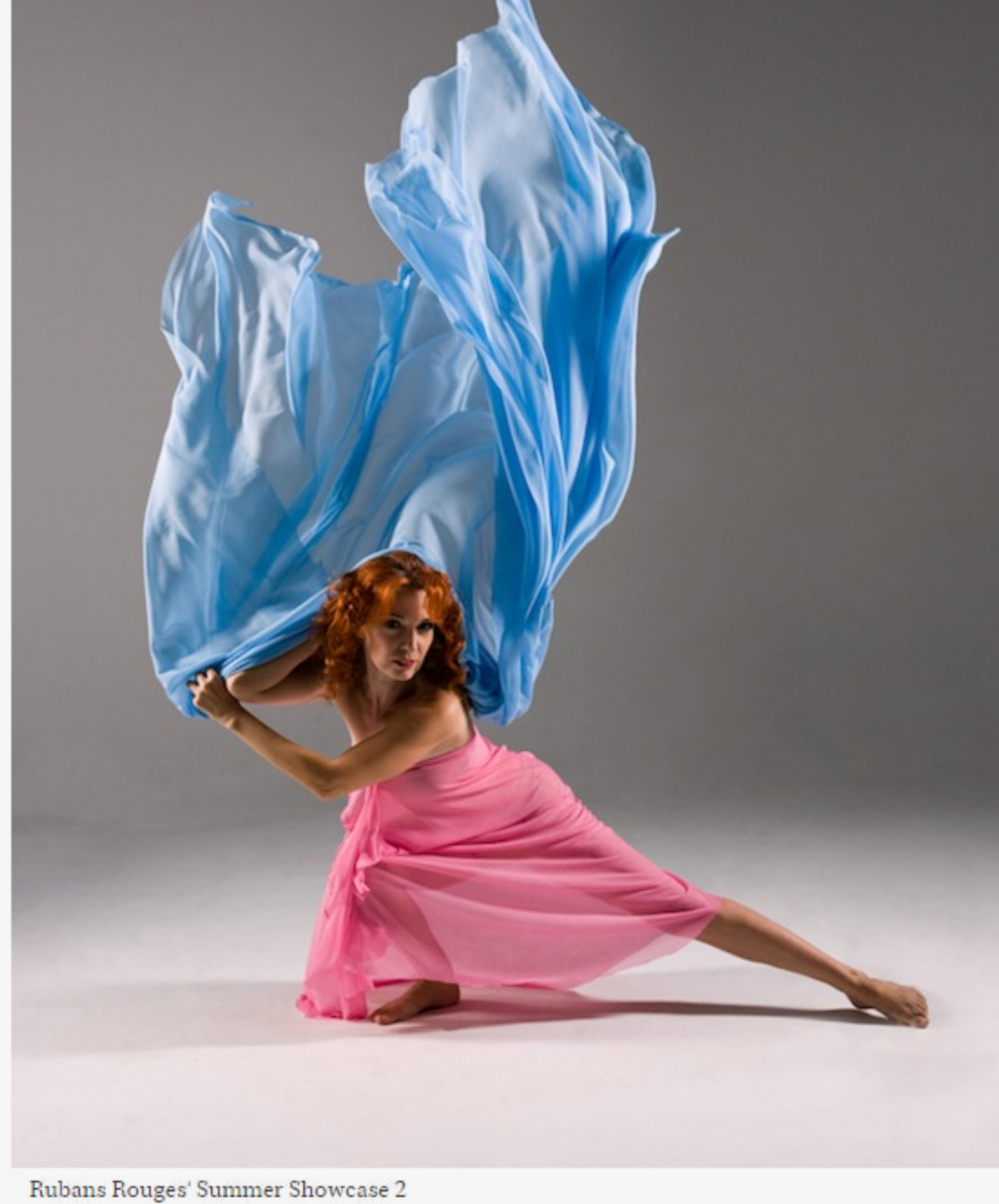
Rubans Rouges' Summer Showcase 2

2. Double down Mexican folk dance Two different Mexican folk dance companies take over the Cahuenga Pass this weekend. On Friday, Resurrección Mexican Folk presents Cuentos y Leyendas de México , using dance to retell popular folk tales, bedtime stories and legends from eight different states and regions of México. For its debut event on Sunday, Unidos Por la Danza (United for Dance) presents folklorico dance and music from Bolivia, Costa Rica, Colombia, Cuba, El Salvador, Mexico, Panama and Peru. At John Anson Ford Amphitheatre, 2580 Cahuenga Blvd. East, Hlywd.; Resurrección Mexican Folk on Fri., Aug. 8, 8:30 p.m., $30. Unidos Por La Danza Sun., Aug. 10, 7 p.m., $25. 323-461-3673, www.fordamphitheatre.org .