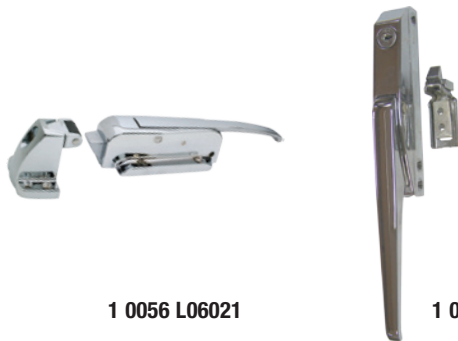
1 0056 L06021