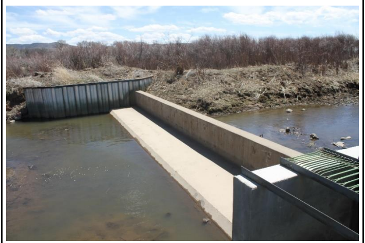
Diversion dam looking upstream