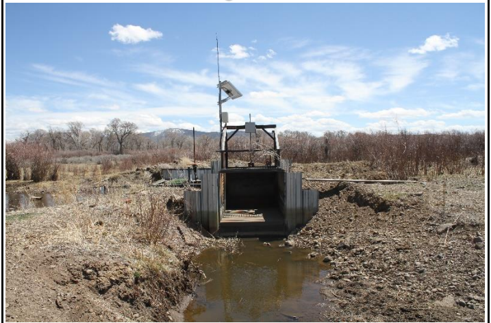
Diversion dam looking upstream