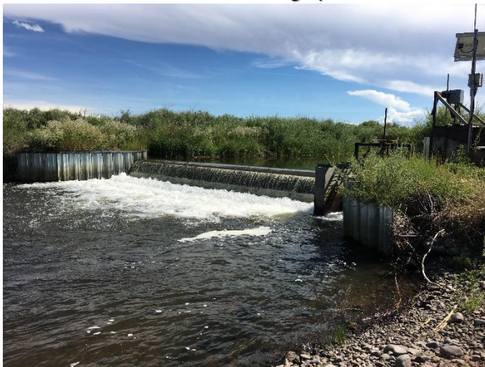
Flume looking upstream