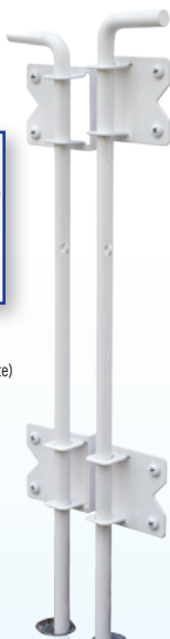
DRAS48-WT 48" Drop Rods (Avail. Black and White)