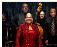
The Jazz Example (above) and pop star Ddendyl (center) Adapted scenes in a live performance (right) - 2015