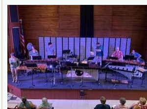
RPO Marimba Band 2022