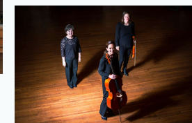
Trio Amusen (below) 2024