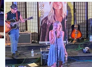
Country star Claudia Hoyser - 2022