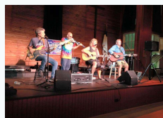
The Old Hippies and Ruby Shooz - 2019