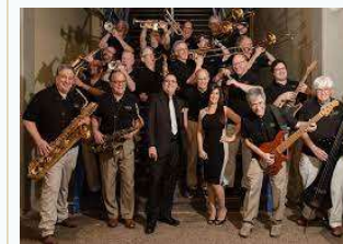
Rochester Metropolitan Jazz Orchestra (above) 2024