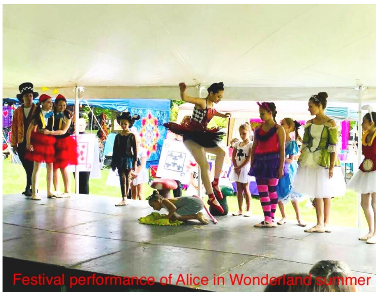
Festival performance of Alice in Wonderland summer