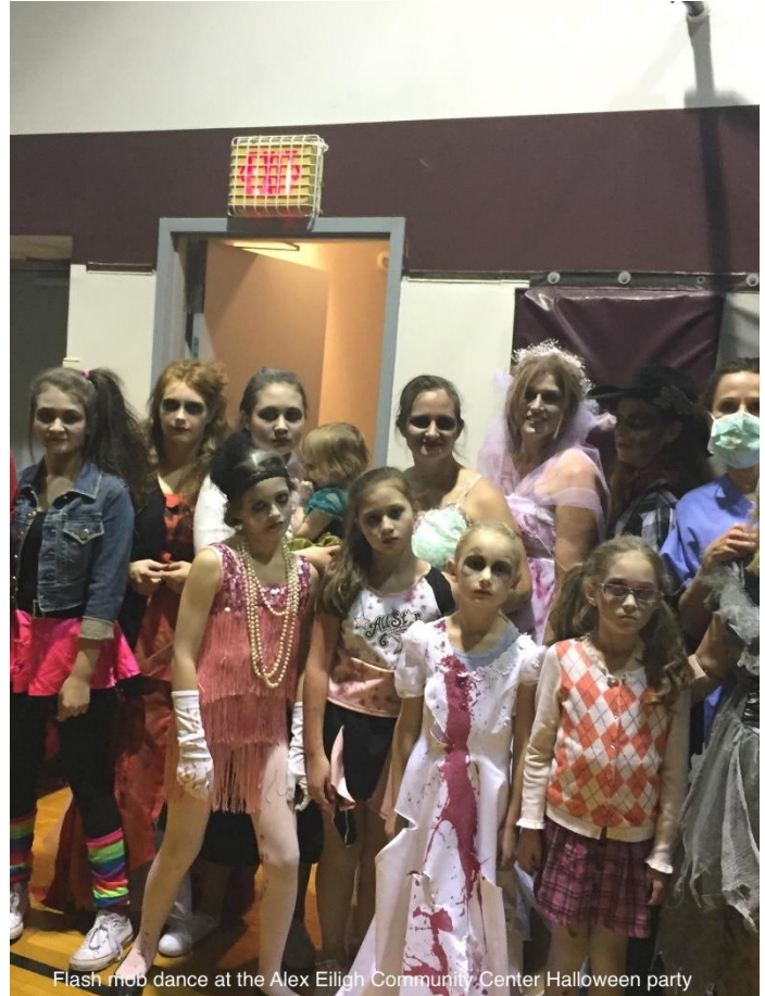
Flash mob dance at the Alex Eiligh Community Center Halloween party