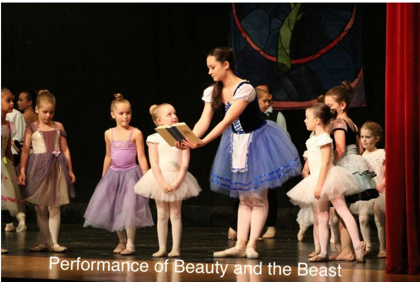
Performance of Beauty and the Beast

Twice a year we provide an opportunity for youth to participate in full semi-professional Ballet productions at the Newark High School, including the annual production of the Nutcracker which is always featured on Finger Lakes TV's Around the Town series.