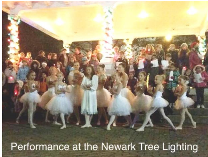
Performance at the Newark Tree Lighting

Twice a year we provide an opportunity for youth to participate in full semi-professional Ballet productions at the Newark High School, including the annual production of the Nutcracker which is always featured on Finger Lakes TV's Around the Town series.