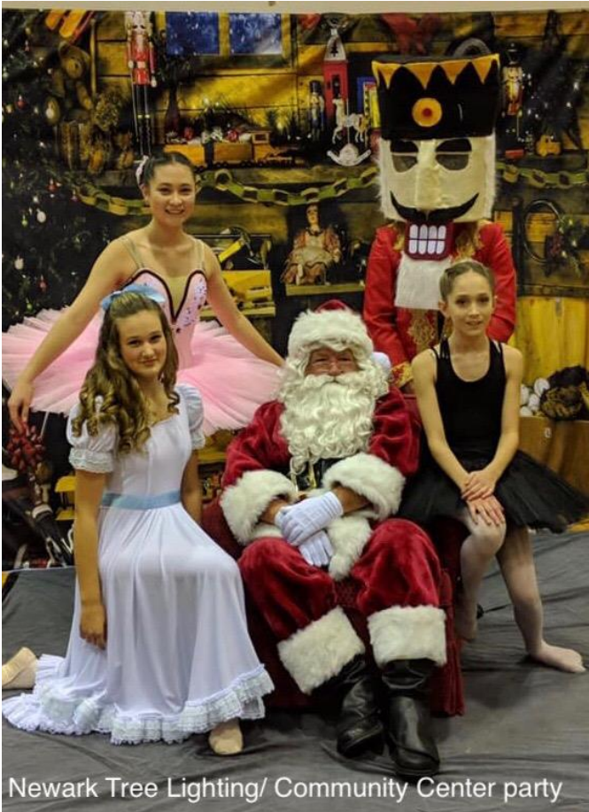
Newark Tree Lighting/ Community Center party

Dance With Me Studios' goal is to provide a fun and affordable dance program so all children can have an opportunity to dance. As part of our program, children grow into talented dancers as well as learn valuable lifelong lessons. Our focus is not just on teaching dance- we teach all our students to be respectful, responsible, and active members of their community. Our dancers participate in numerous activities in Wayne and Ontario County- including Newark's Halloween party at the Community Center and Tree Lighting ceremony in December.