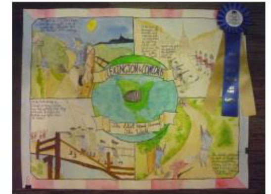
The Americanism Poster Contest

“The objects of this Society are declared to be patriotic, historical, and educational....” -Constitution of the SAR Article II