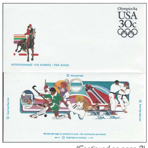
(Continued on page 2)

Postal stationery of USA shows how you can look for not the iust front. but also other pictorial images on back. the Both can be