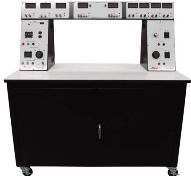
MODEL HMD-100A-CM-DA Shipping Weight: 700 lb.