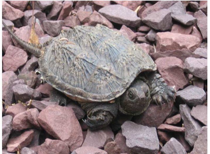
Life in the country – a visitor