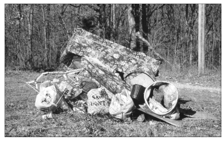
Here's what we pulled out of the woods. Hey, that's a hide-a-bed couch!