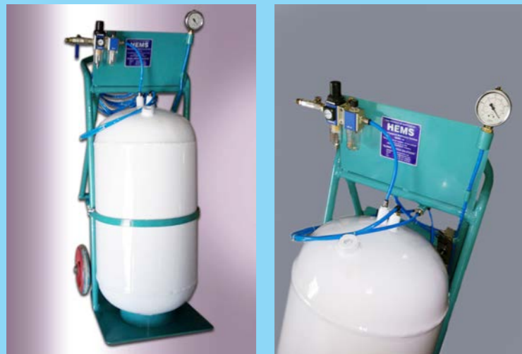
SLT - 40/LS

HEMS SLT-40/LS Seal Lubricator & Tester is a trolley mounted portable unit used for lubricating/ servicing track chains, rollers and idlers. It is provided with an oil dispenser and provision for vacuum test with gauges and indicators. Only compressed air supply is required to operate the machine.