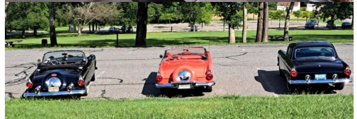
The early birder's birds