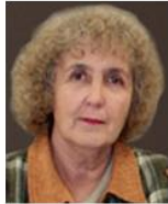
By Jaine Treadwell