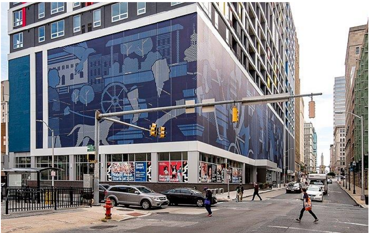
Huge vinyl mesh building wrap (over 17,000 sq. ft) that encloses 5 levels of an exposed parking garage of a residential building in Baltimore, MD. Realized with our TS44 extrusion .