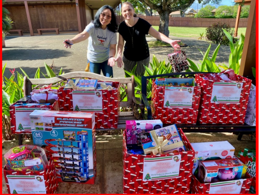
Additional photos of the 2023 CLC Angel Tree will be featured in the 2023 Annual Report.