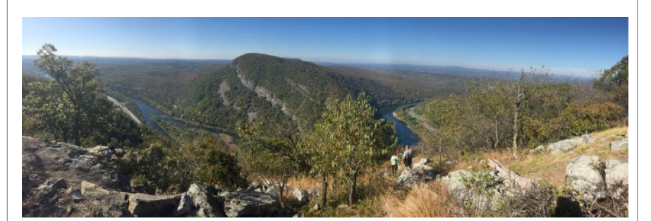
Click here for pictures / video

Nevertheless we were up the next morning with breakfast ready and lunches packed. The Troop was split up into two groups. Respectively, the two groups were the long hike today and wolves on Sunday and short hike today, wolves today. I went on the long hike.