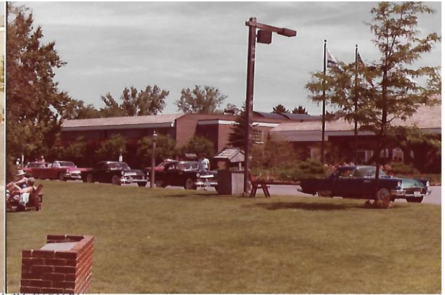
NORTHEASTERN REGIONAL C.T.C.F. SANCTIONED STURBRIDGE, MASS. SHERATON INN JULY 15, 16, 17 1983